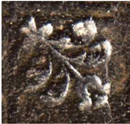
16 H 125, particolare. Cfr. DE MARINIS 1960, II.