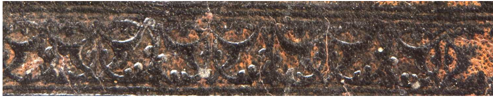
16 H 125, particolare. Cfr. DE MARINIS 1960, II.