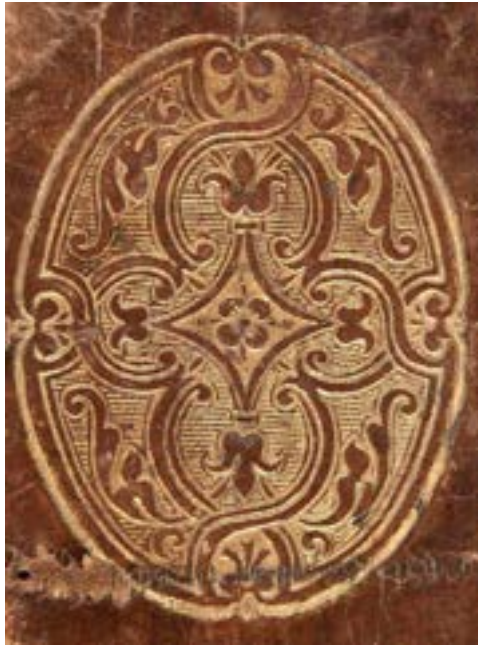
16 I 412, particolare.