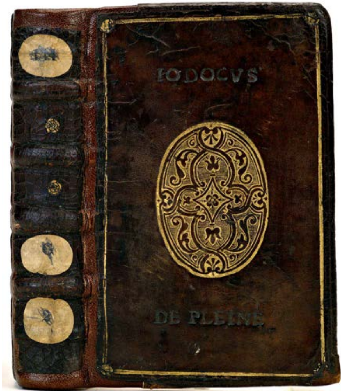
Den Haag, Koninklijke Bibliotheek, 1708 G 26, P. Ovidius Naso, Metamorphoseon Lib. XV. Antverpiae, Chr. Pantinus, 1575.