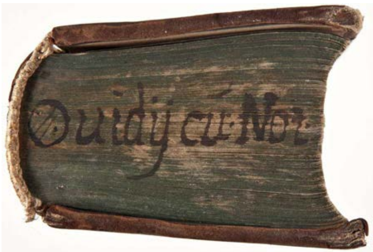
16 I 474, particolare.