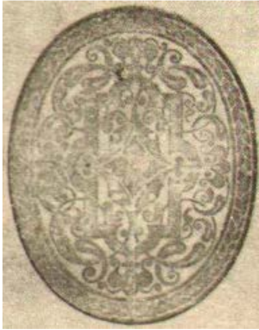
STRZEMBOSZ 1959, Abb. 4, dettaglio.