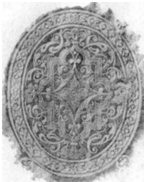
The library of the Poznań society of friends of sciences, 34917.III adl. 34918.III.