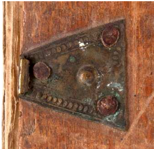
17 E 175, particolare. Cfr. ADLER 2010, Abb. 6-01, 6-02, 6-03 a+b, 6.04a-d.