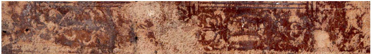
17 E 175, particolare.