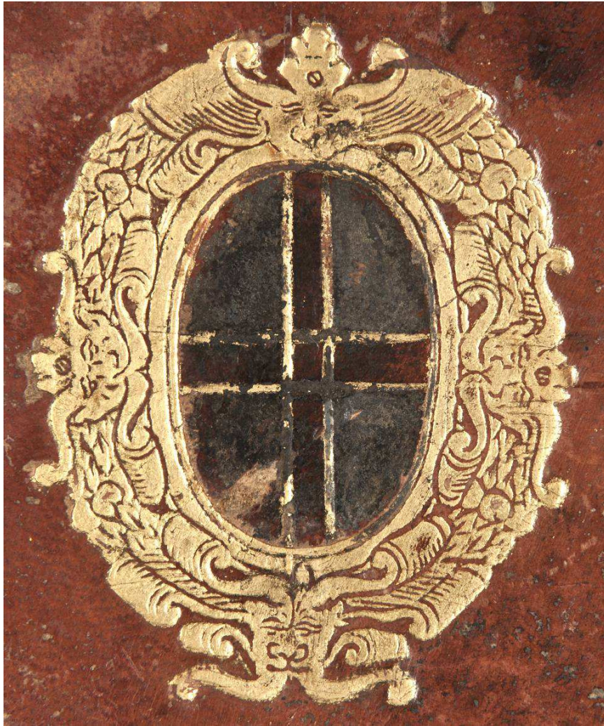
10 D 215, particolare.