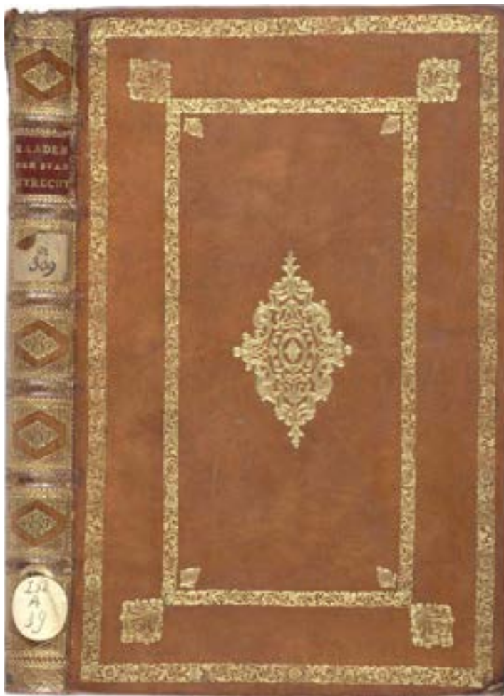
Den Haag, Koninklijke Bibliotheek, 132A39.