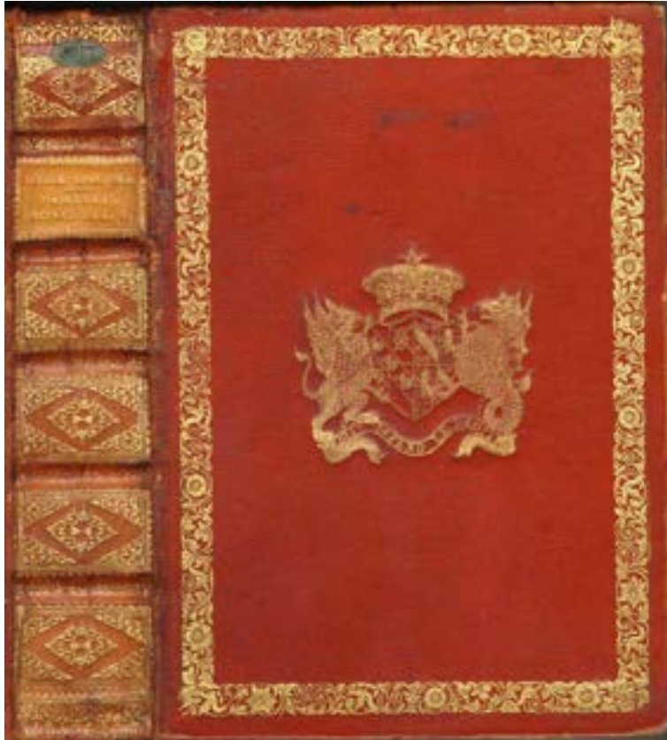
London, British Library, g9277.