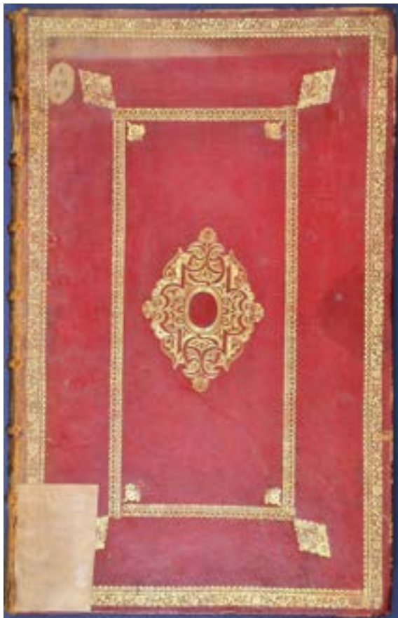
Milano, Biblioteca Braidense, F.XIII.33.